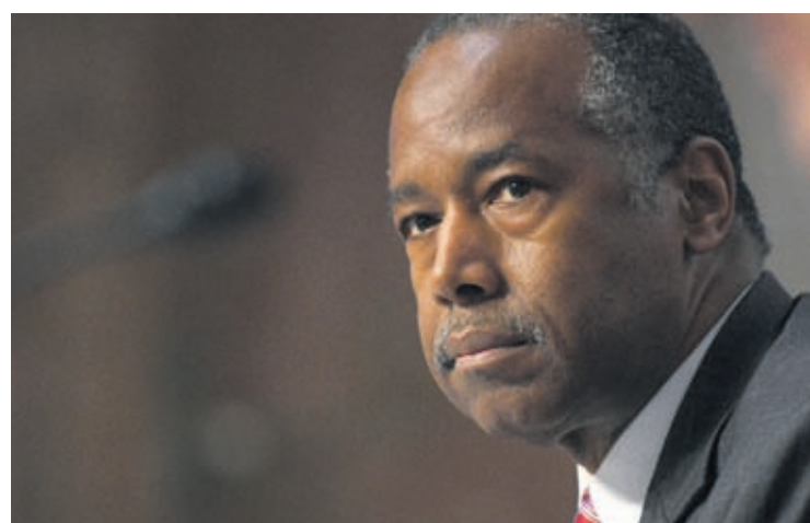
Housing and Urban Development Secretary Ben Carson testifies before a Senate Banking, Housing, and Urban Affairs Committee hearing on Capitol Hill in Washington, Tuesday, June 9, 2020.